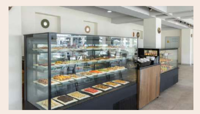
Aqua Snack Passion Cocktail Bar Patisserie