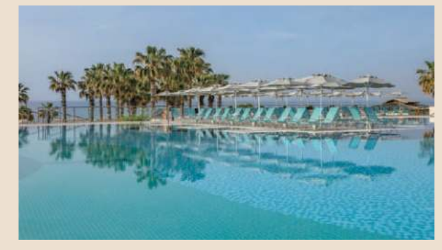
Aqua Park Pool Indoor Pool Main Pool