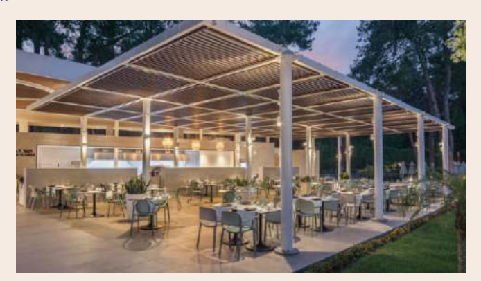
Mexican A La Carte Turkish A La Carte Far East A La Carte